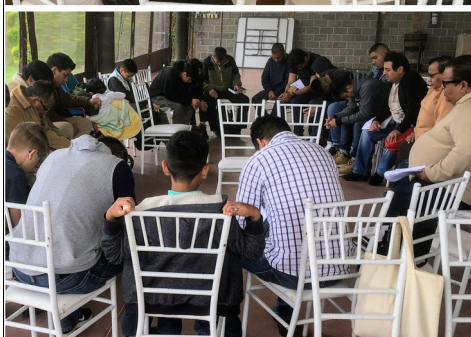
(above) A special Sunday prayer time in the church plant in Las Palmas (women above, men below) – 19 January 2020

* Yes, we're aware that the almond we eat is not technically a nut – it's the seed of the almond fruit (similar to the inside of a peach pit). The fruit is edible, but rare in most of the world because it spoils so quickly. Parts of the almond that we don't eat are typically fed to cattle.