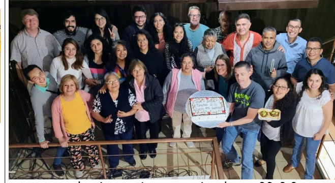
Graduating Class September 2022